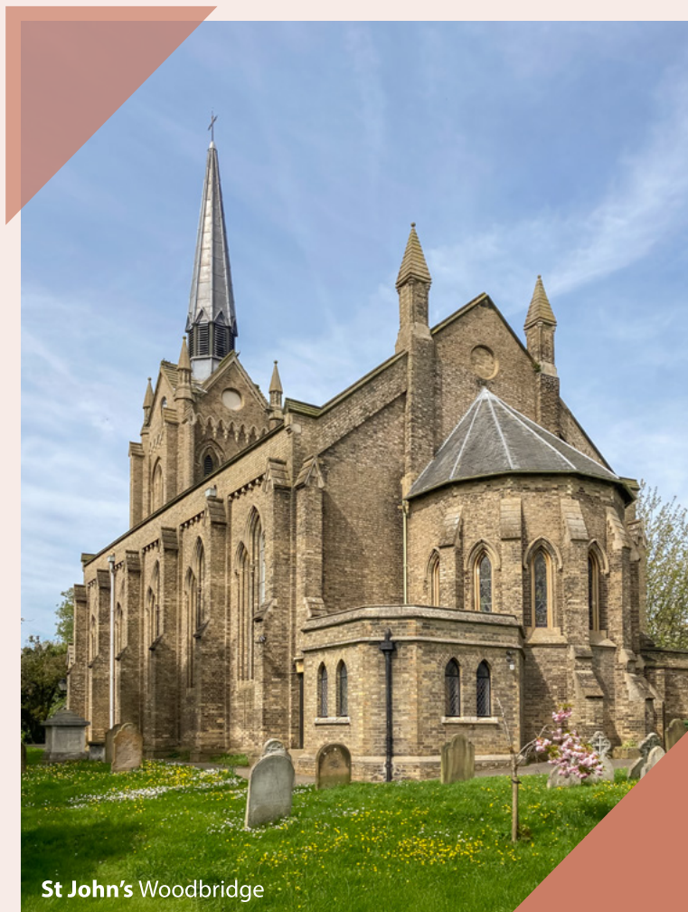
St John's Woodbridge