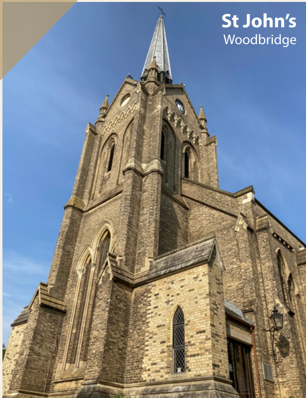
St John's Woodbridge