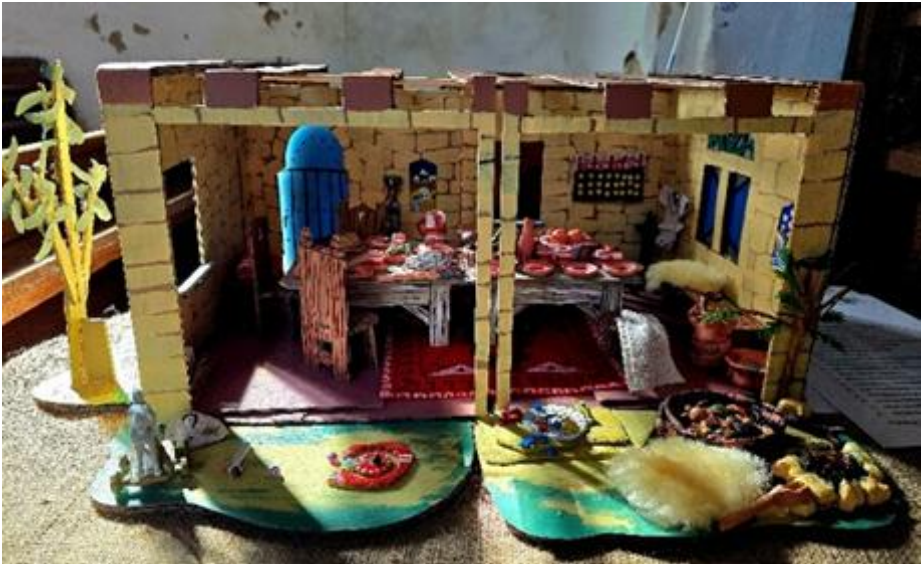
MODEL OF THE LAST SUPPER BY LINDSAY MARRIOTT

NEWS OF THE PARISH OF ST ANDREW'S BREDFIELD