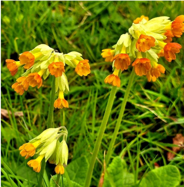
COWSLIPS IN THE CHURCHYARD — PHOTO BY ANN STAMMERS

NEWS OF THE PARISH OF ST ANDREW'S BREDFIELD